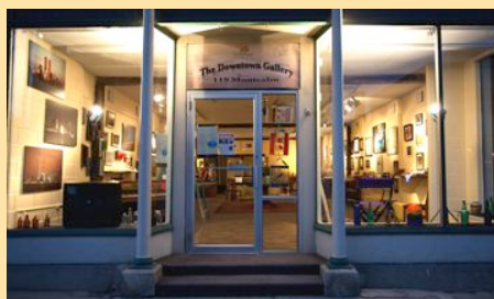
Our new home. We're sharing space with the Downtown Gallery