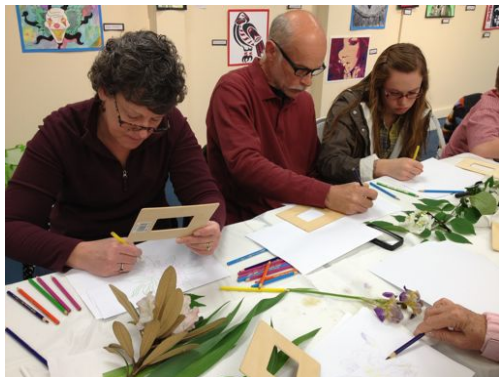
Artists explore the visual techniques of Georgia O'Keeffe in a workshop at the gallery led by the Hyde Museum.

Visual, performance, craft, and literary arts are finding a strong audience in our community.